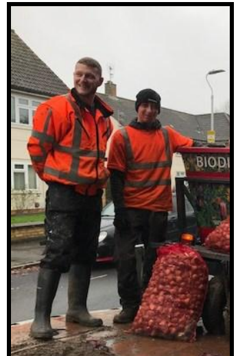
The team mechanically bulb planting

The planters were requested by the South Ruislip Residents and funding provided by Lagams, the South Ruislip Ward Councillors, the local Chamber of Commerce and the SRRA..