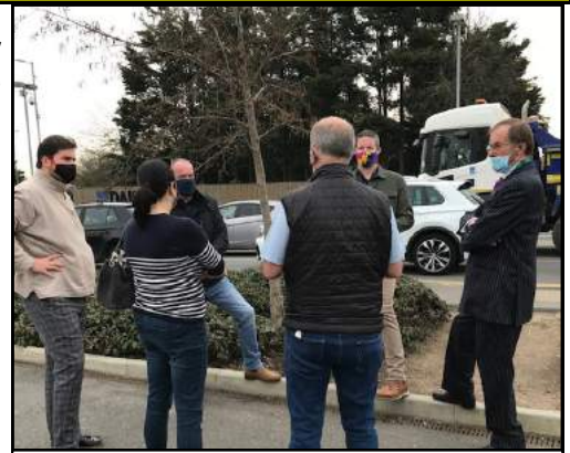
HS2 team visit South Ruislip to check out lorry movement

If you have any further questions or comment please contact the Vice Chairman who will liaise with the HS2 Community Committee.